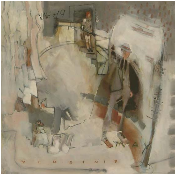
'To Dance with my Father Again' 22"x22" Jinnie May Bronze Medal

A very intriguing painting, telling a wonderful story. Unlike a bold painting, the color palette and message are soft and invite careful consideration and intimacy. The creativity & message is intriguing. The wise use of black to encompass the main figure is good use of the design elements & the use of warm & cool takes it away from monochromatic and adds interest. The curvilinear approach not only adds to the story, it encourages the viewer to wander throughout the painting and take in all the information.