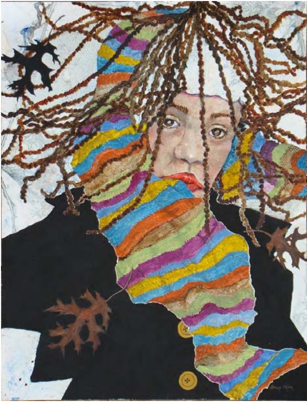
'Eyes of the Beholder'-26" x 20"