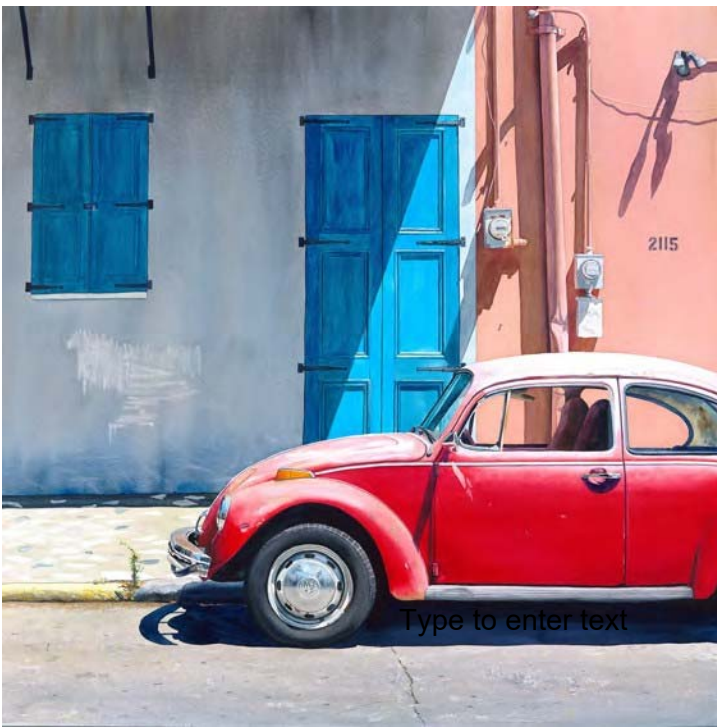
'Punch Buggy Red' 29" x 29"