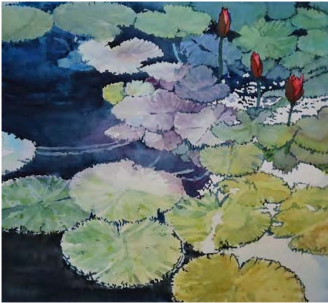
'Water Lilies 2'