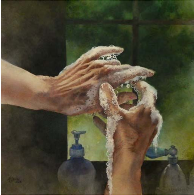
'Twenty Seconds'- 15" x 15"